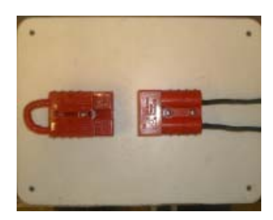
N.B. All house robots are fitted with this device. So it can be done!